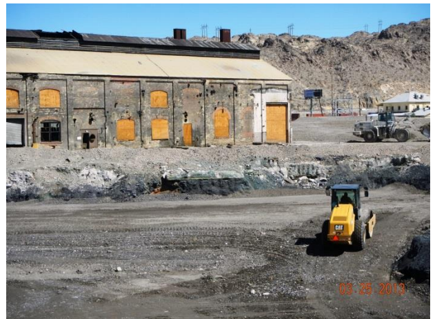
Compaction of structural backfill within the ConTop Basement