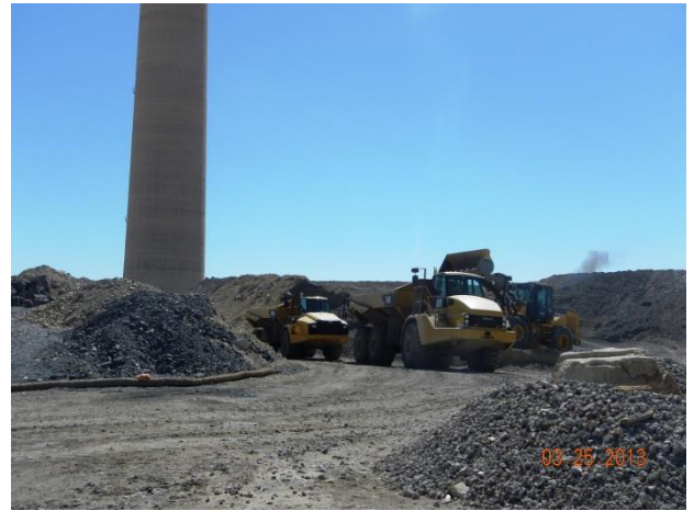
Loading of Category II materials from existing Stockpile #2