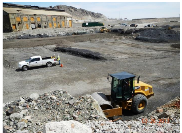
Current conditions within the ConTop Basement