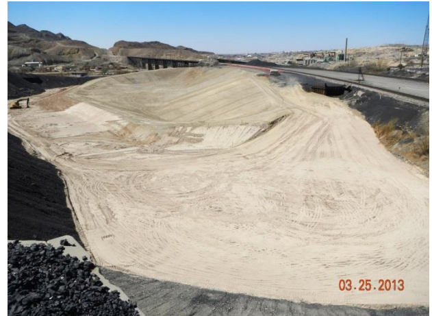
Current conditions within the PBA Channel and the Category 1 Landfill