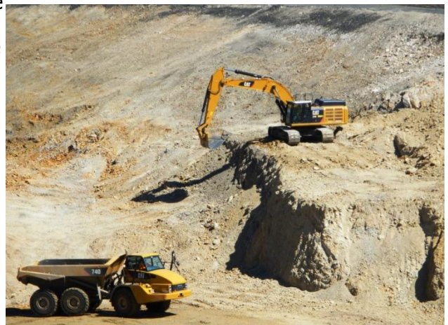
Excavation, loading and grading activities within the Category 1 Landfill footprint