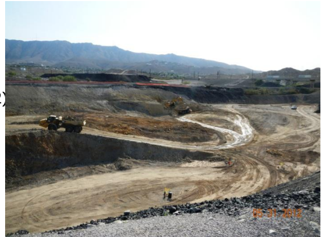
Hauling Cat 1 Landfill materials to stockpile area.