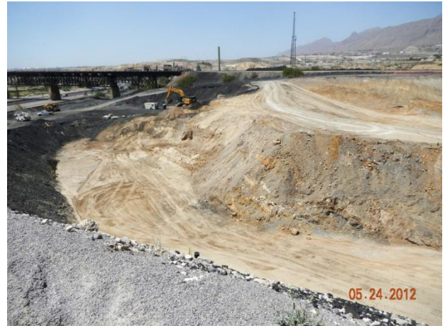
Excavation activities within the Category 1 Landfill footprint