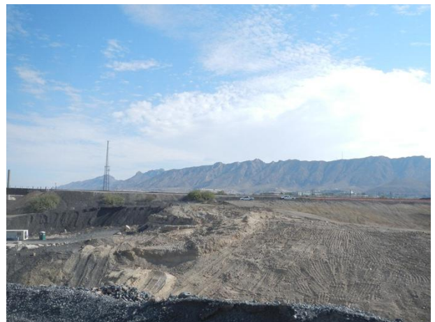
Excavated western facing CAT 1 Landfill slope