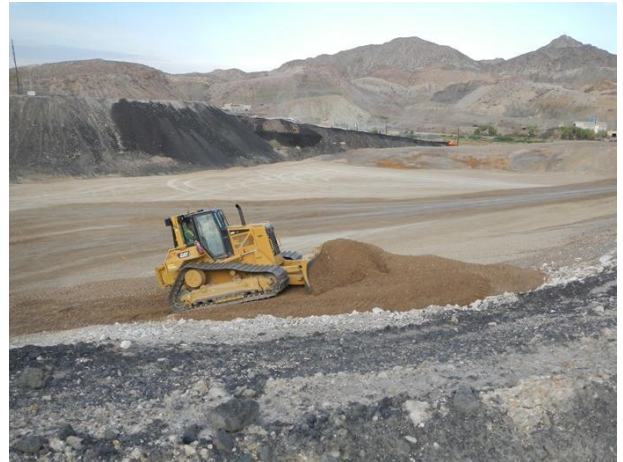
Structural backfill placement and compaction within the Category 1 Landfill footprint