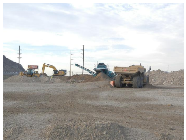
Material processing activities associated with mobile screen