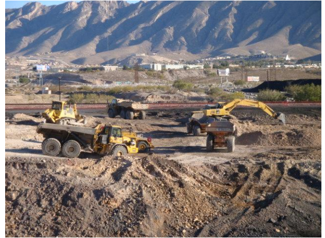
Loading targeted mass excavation materials from within the Category 1 Landfill footprint.