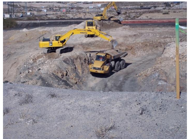
Excavation activities within the Category 1 Landfill footprint.