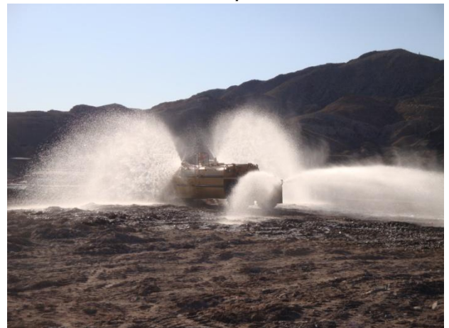
Fugitive dust control within Category 1 Landfill footprint.