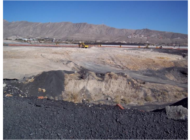
Current conditions of the Category 1 Landfill.

Prepared by EJ Suardini, November 21, 2011