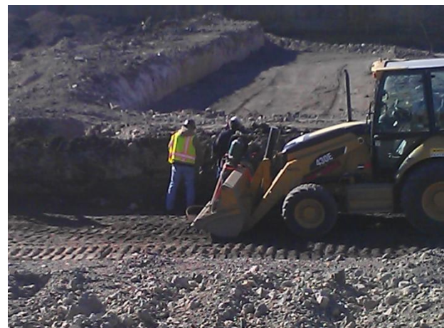
Removing existing rebar within ConTop Basement