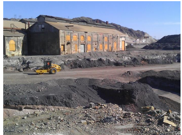
Subgrade preparation activities within the ConTop Basement