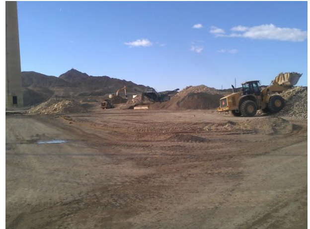
Screening of CAT II materials to meet 3-inch minus specifications