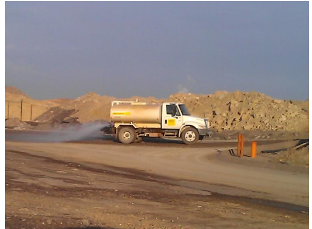
Dust suppression along haul roads

Prepared by EJ Suardini, December 27, 2012