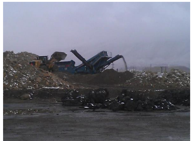
Screening of Category II materials to meet 3-inch minus backfill specifications