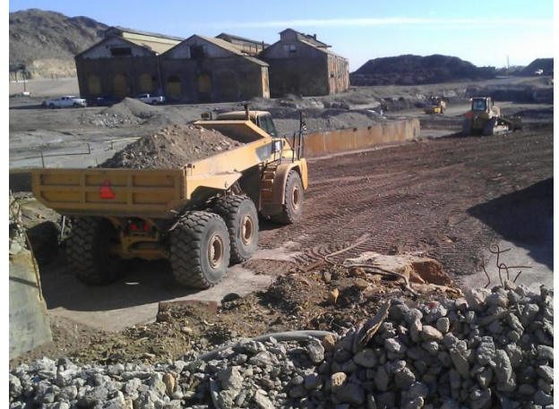
Category II backfill activities within the ConTop Basement