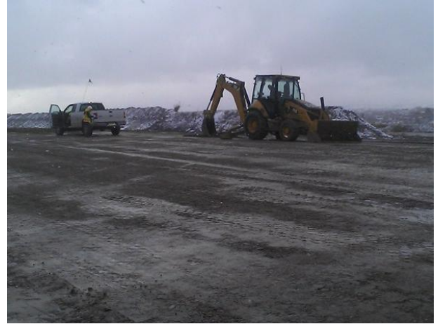
Completed backfill of Ore Unloading Basement

Prepared by EJ Suardini, January 8, 2013