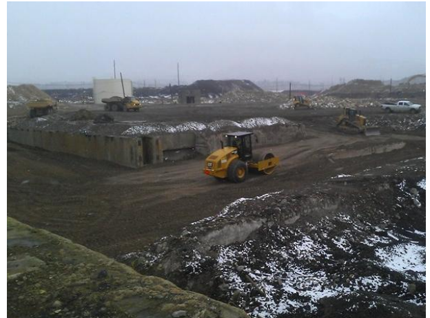
Category II compaction activities within the ConTop Basement