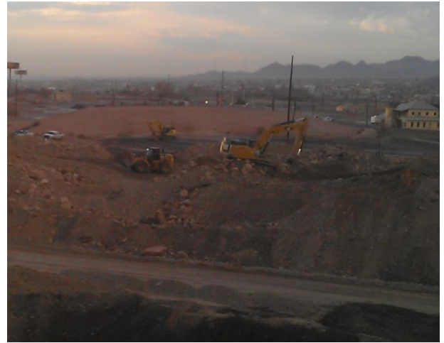
Excavation of Category II materials from within existing stockpile #1

Prepared by EJ Suardini, January 15, 2013