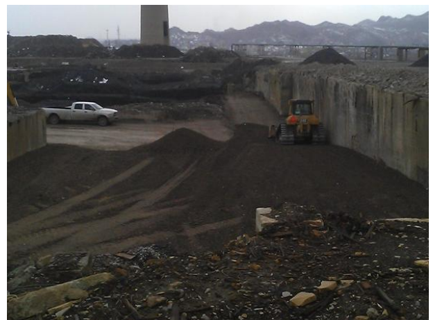
Category II compaction and grading activities within the ConTop Basement