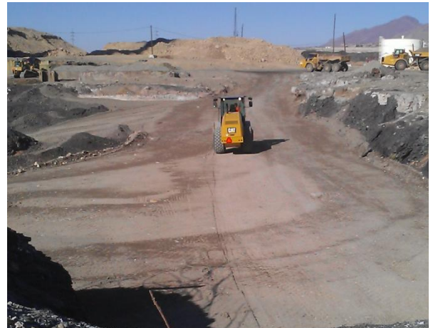
Category II backfill activities within the ConTop Basement