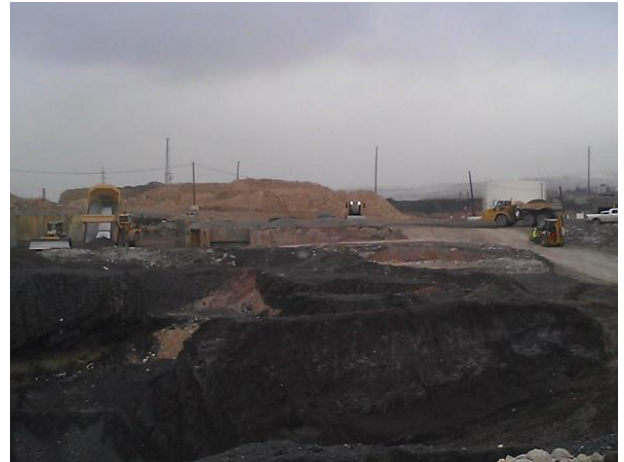
Placement of Category II backfill within the ConTop Basement