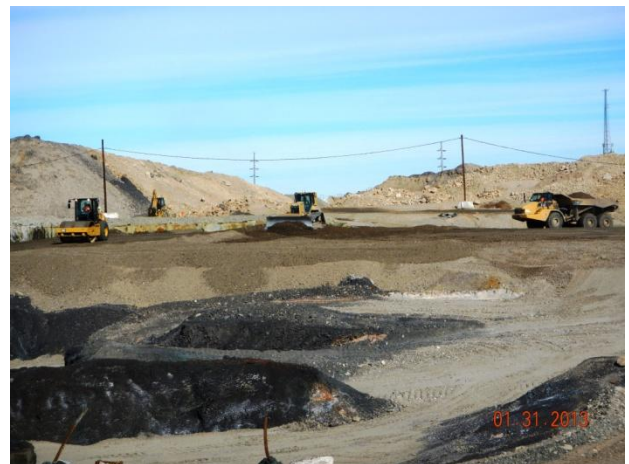
Category II soil conditioning and compaction within the ConTop Basement