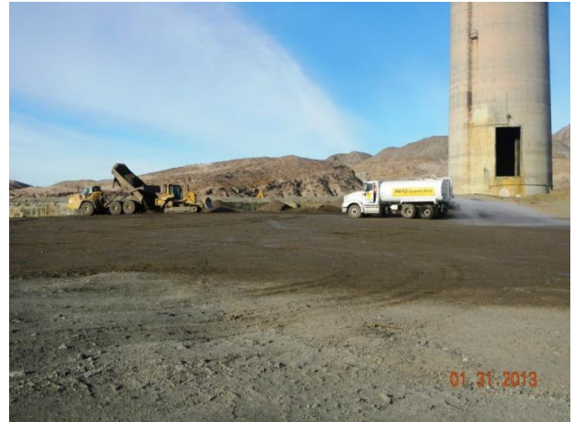
Grading of Category II backfill within the ConTop Basement