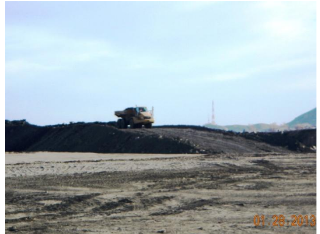
Hauling and stockpiling activities associated with the ConTop slag materials

Prepared by EJ Suardini, February 5, 2013