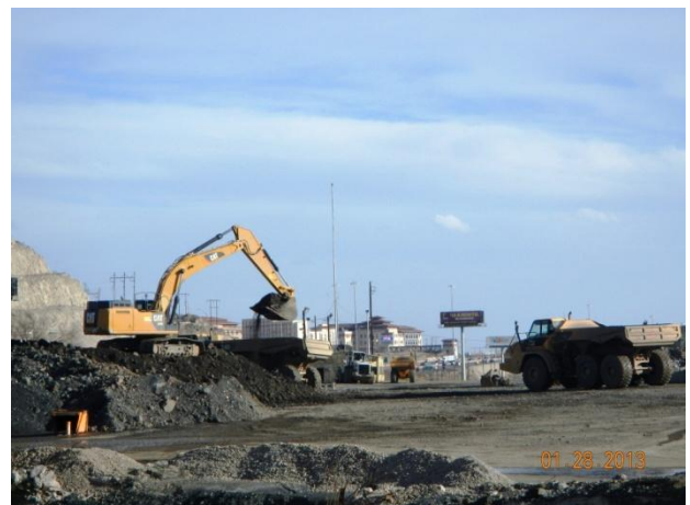
Relocation activities associated with the ConTop slag pile