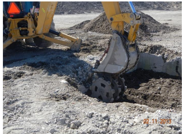
Category II soil conditioning and compaction within a small basement/pit