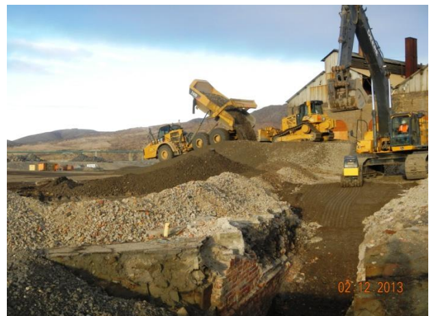
Category II soil compaction and construction activities associated with the South Stack berms