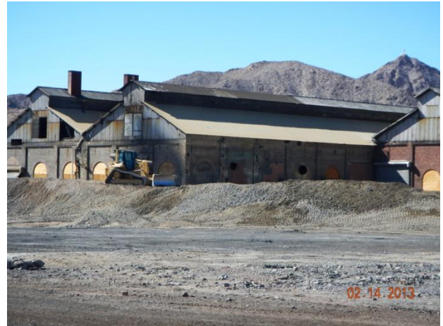
South Stack berm construction activities