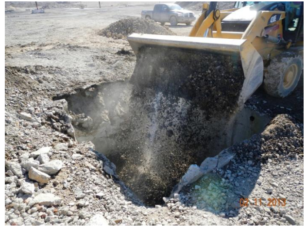
Installation of 3-inch minus backfill within a small basement/pit

Prepared by EJ Suardini, February 19, 2013