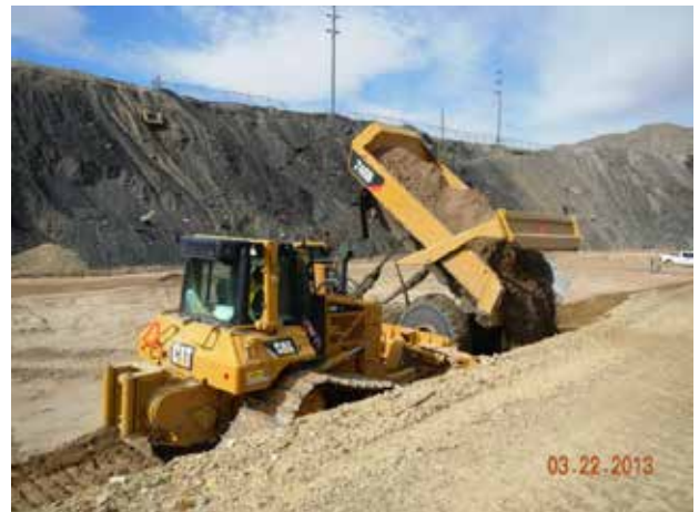
Installation of structural backfill within the PBA Channel