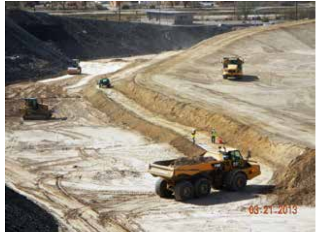
Backfill installation activities within the PBA Channel