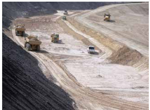
Moisture conditioning and compaction of structural backfill within the PBA Channel