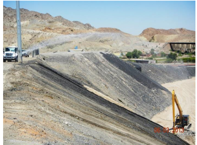
Plant slope stabilization activities within Area 2.