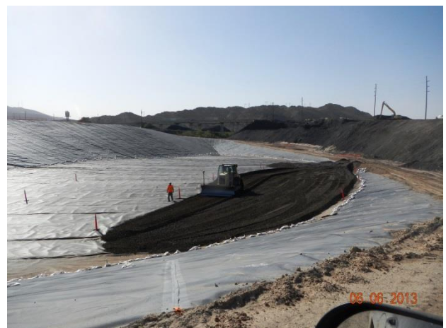
Installation of geosynthetic protective layer within CAT I Landfill