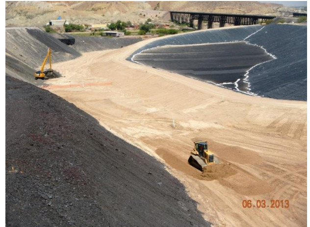
Grading within the PBA Channel