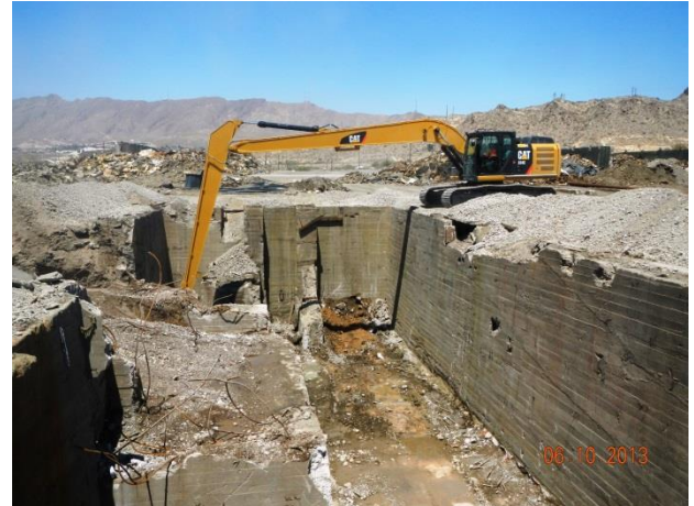
Removing loose debris within plant basement prior to backfill installation