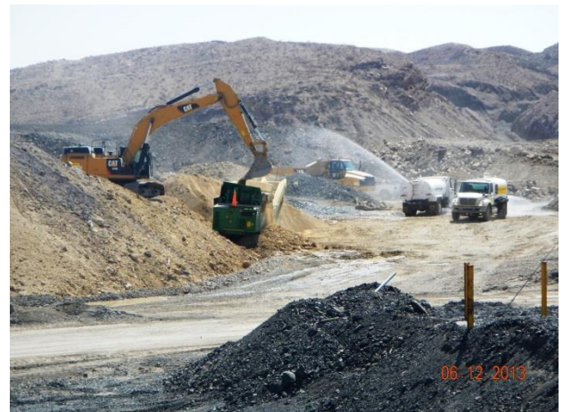
Screening of Category II material to produce protective layer material from Stockpile #2