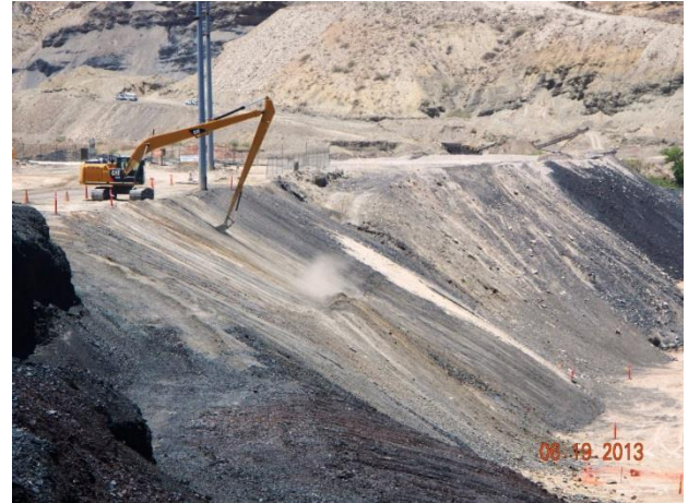
Plant slope stabilization activities within Area 2