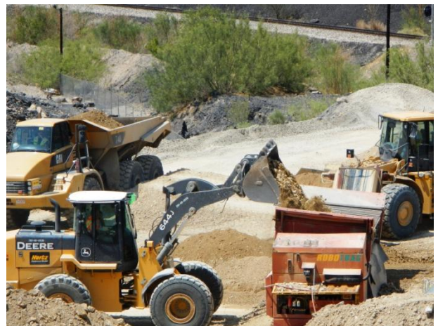
Material processing activities associated with mobile screen