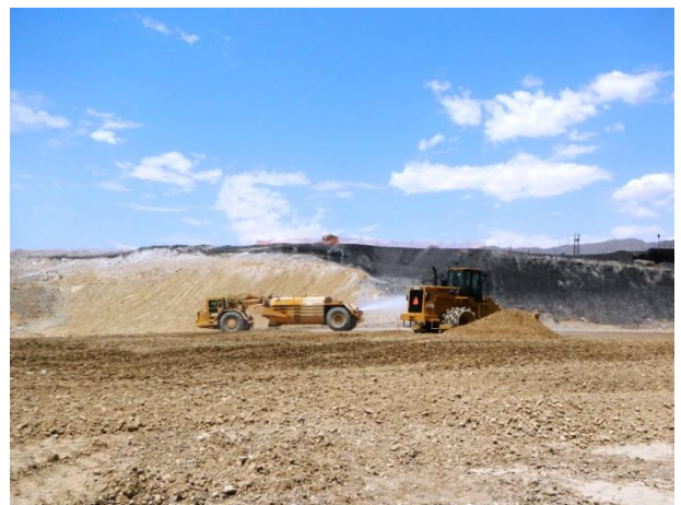
Moisture conditioning and compaction of structural fill