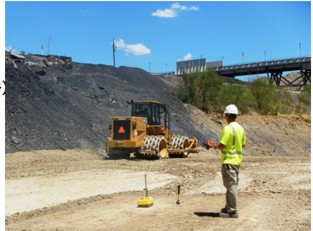
Field compaction testing of structural fill materials