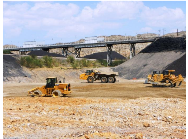
Structural backfill placement and compaction within the Category 1 Landfill footprint