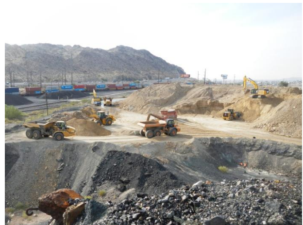
Material processing activities associated with mobile screen