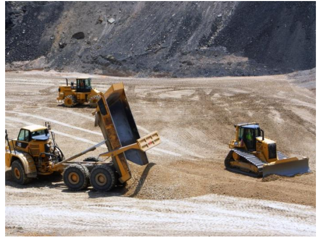
Structural backfill placement and compaction within the Category 1 Landfill footprint