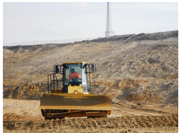
Grading and compacting structural fill