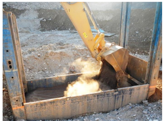
Installation of ZVI backfill within the slide rail system associated with PRB 2