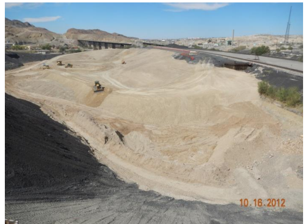
PBA and CAT 1 Landfill current conditions