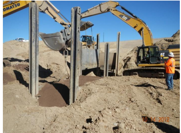
Removal of slide rail system components