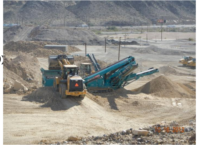
Screening of existing stockpiles to process structural fill

Prepared by EJ Suardini, October 23, 2012