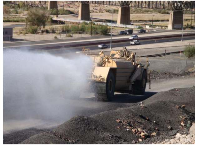
Applying water to access roads for dust control.

Prepared by EJ Suardini, November 1, 2011