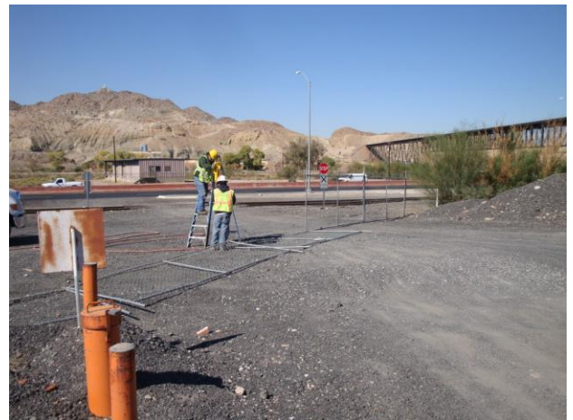
Installation of temporary site security fencing along Piasano Drive.