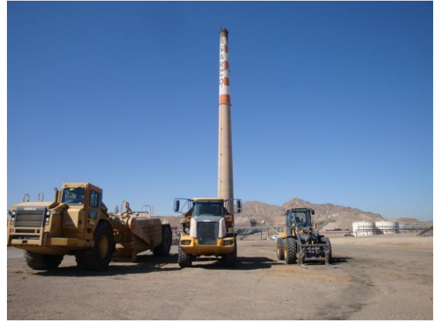
Taking delivery of select heavy equipment