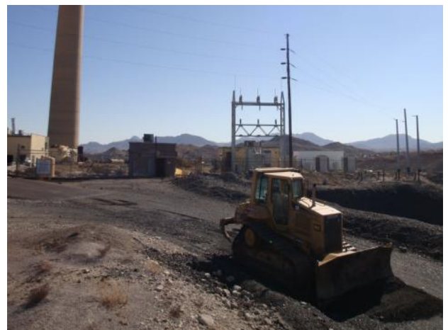
Bulldozer grading existing access road.