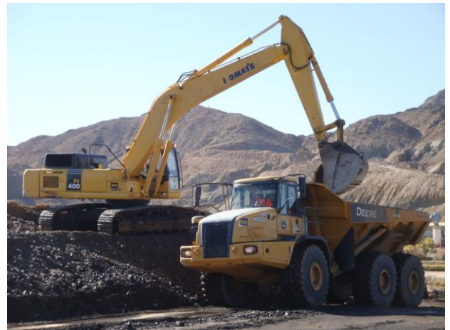
Loading Slag from within the Category 1 Landfill footprint.