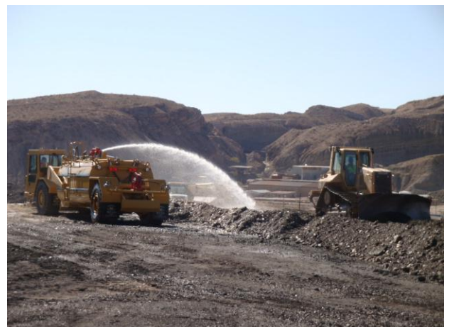
Dust control and stockpile management activities within designated stockpile area.