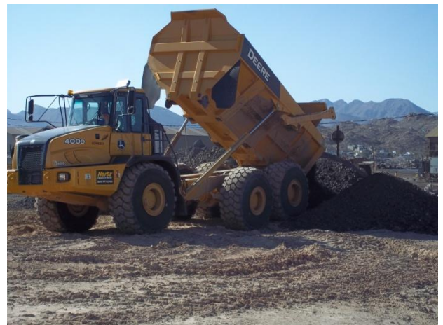
Dumping Slag within designated stockpile area.