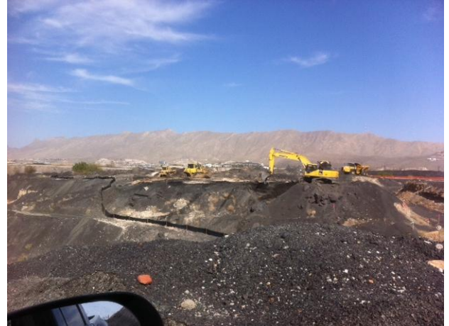
Excavation of Slag from Southwest corner of Category 1 Landfill.

Prepared by EJ Suardini, November 8, 2011