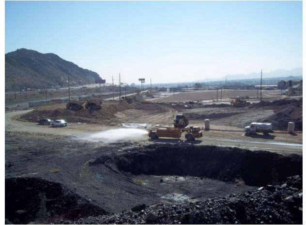
Dust control activities in and around the stockpile area.

Prepared by EJ Suardini, December 7, 2011