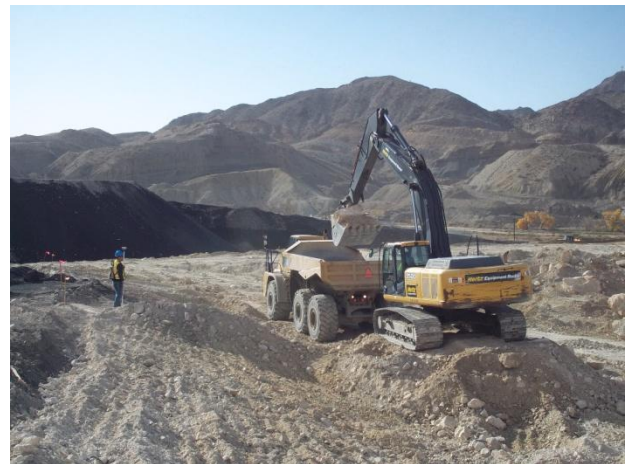
Excavation activities within the Category 1 Landfill footprint.