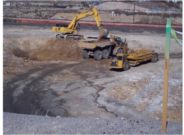
Loading targeted mass excavation materials from within the Category 1 Landfill footprint.