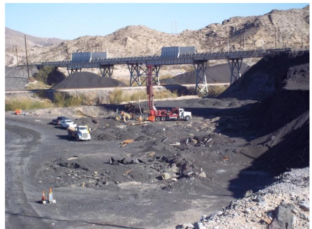
Drilling activities associated with investigation borings within PBA.