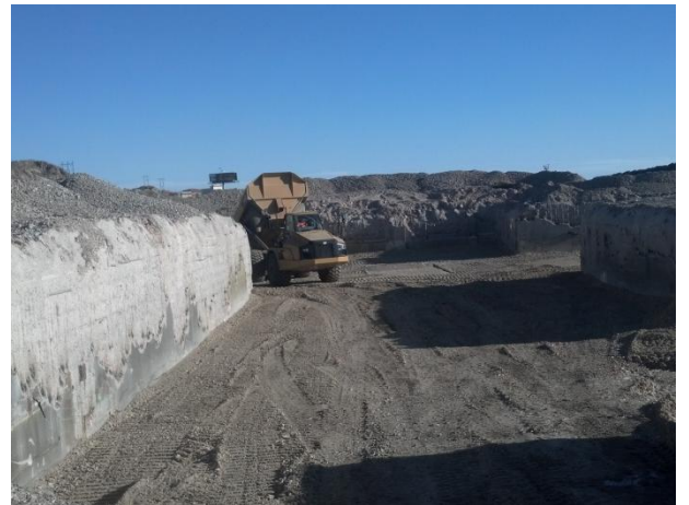
Placement of CAT II soils within the Ore Unloading Basement