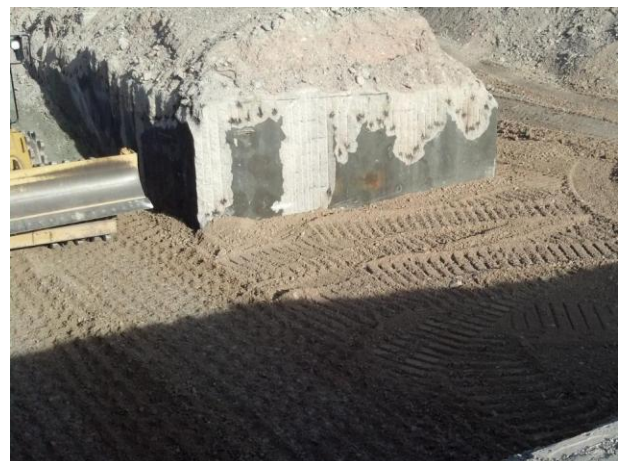
Compaction of CAT II soils within the Ore Unloading Basement