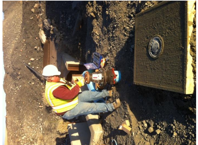
POTW Tie-In Installation

Prepared by EJ Suardini, December 11, 2012