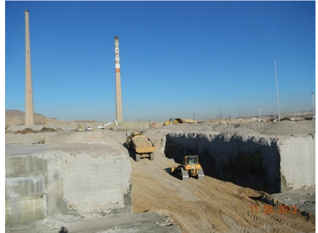
Installation of CAT II soils within the Ore Unloading Basement