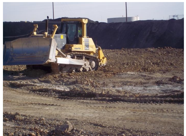
Ripping activities within the Category 1 Landfill footprint.