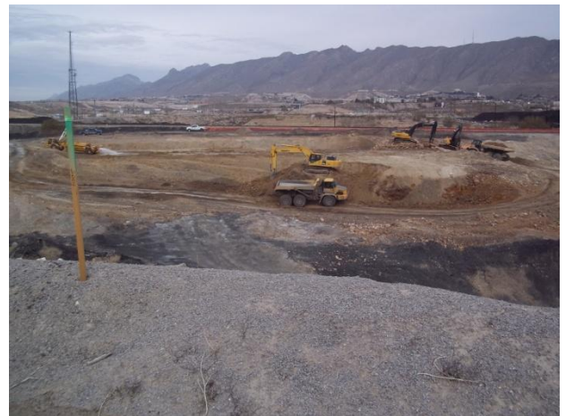
Excavation activities within the Category 1 Landfill footprint.