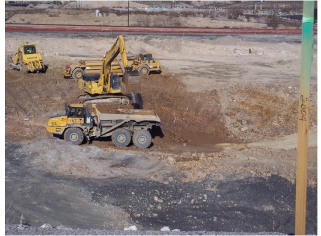
Loading targeted mass excavation materials from within the Category 1 Landfill footprint.