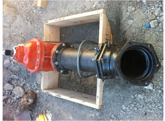
Newly installed valve associated with POTW Tie-In

Prepared by EJ Suardini, December 18, 2012