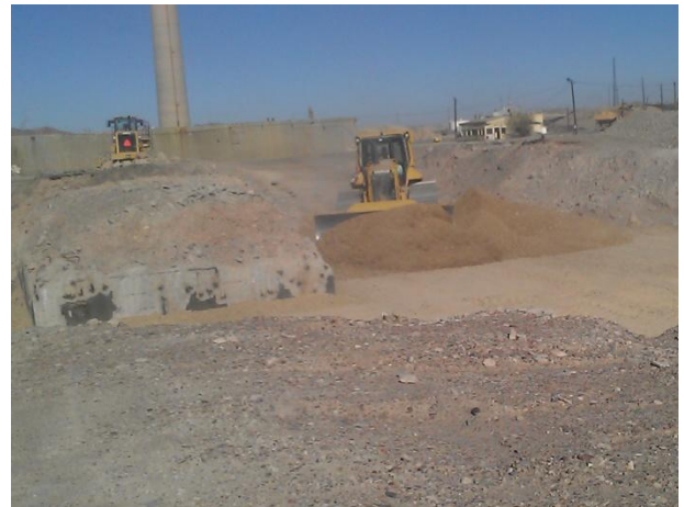
Placement of CAT II soils within the Ore Unloading Basement