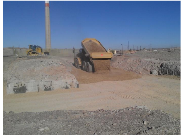
Installation of CAT II soils within the Ore Unloading Basement