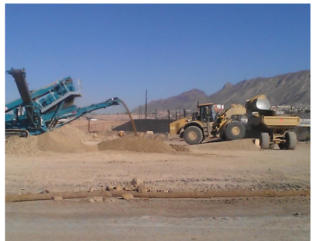
Screening of CAT II soils for Ore Unloading Basement