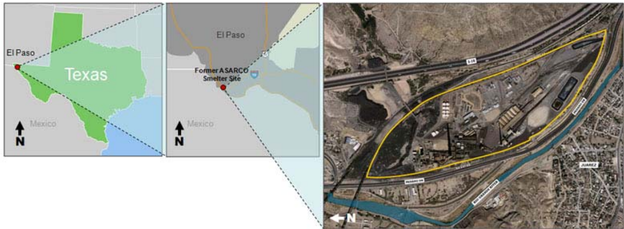
Figure 2: Site Location Map

The site is located within a mixed commercial/industrial area. Additionally, the University of Texas at El Paso (UTEP) is located to the east of the Site. (Refer to Figure 3 Site Features Map).