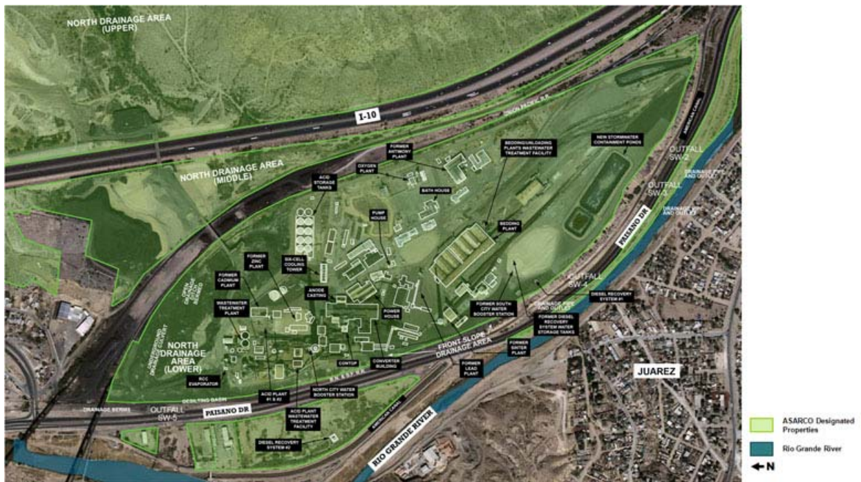
Figure 3: Site Features Map

The site is located within a mixed commercial/industrial area. Additionally, the University of Texas at El Paso (UTEP) is located to the east of the Site. (Refer to Figure 3 Site Features Map).